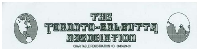
TCF first logo for letterhead created in 1989