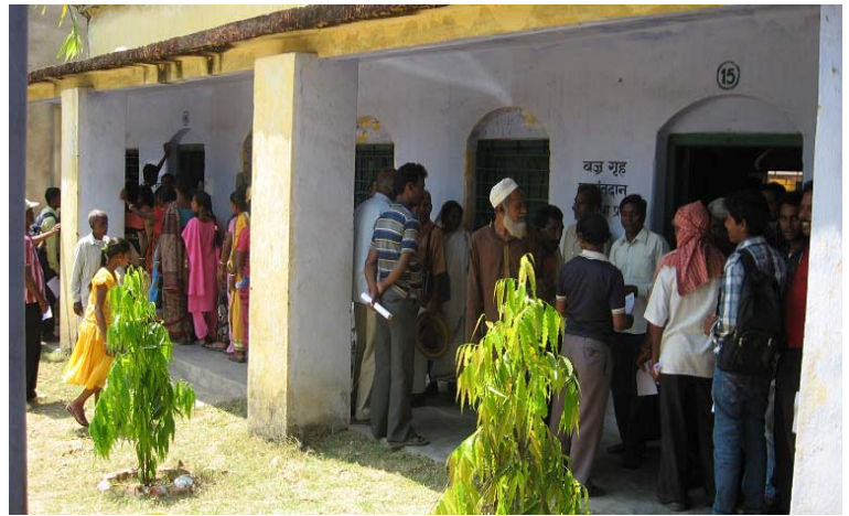
Ghatsila eye camp—Patients lined up

In the last 12 months, TCF delivered over 3000 eye glasses to people who needed them the most. Donors, supporters and volunteers would be pleased to know that this time TCF collaborated with 4 different NGOs (TCA, Arogya Sandhan, Lily Foundation and Ushagram Trust) to deliver 21 eye camps in villages both near and far, surrounding Calcutta. One such eye camp was held jointly with Lily Foundation in Ghatsila, Jharkand, which was about 240 km from Calcutta, on 21 March 2013. Done in co-operation with Jagadish Chandra High School, mostly tribal people attended this eye camp. TCF held 12 eye camps with Arogya Sandhan and 7 eye camps with TCA, TCF's Calcutta chapter. Ushagram Trust also held one eye camp in Ushagram for TCF. In fact, during the period of 2012 - 2013 TCF was able to run more eye camps than ever possible in the history of the charity. It was made possible by your generous support.