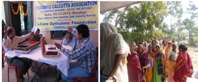
Eye camps sponsored by Morgan Bay Capital & ICare